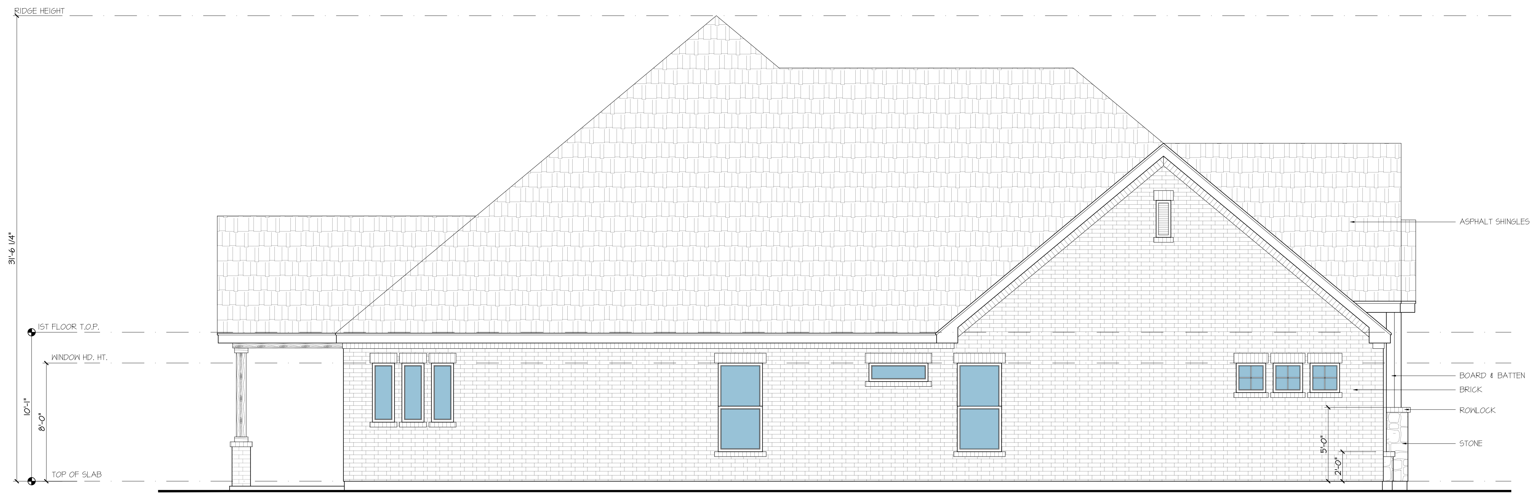
2 LEFT ELEVATION SCALE: 1/4" = 1'-0"