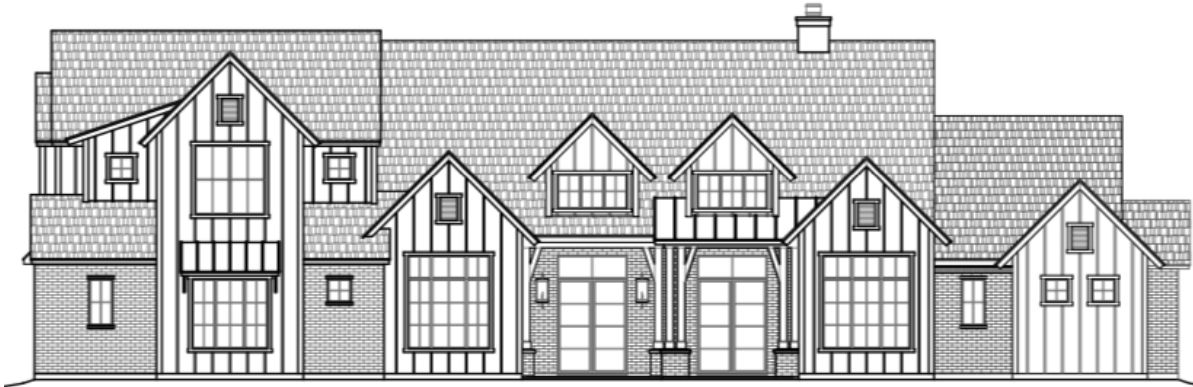
- FRONT ELEVATION -