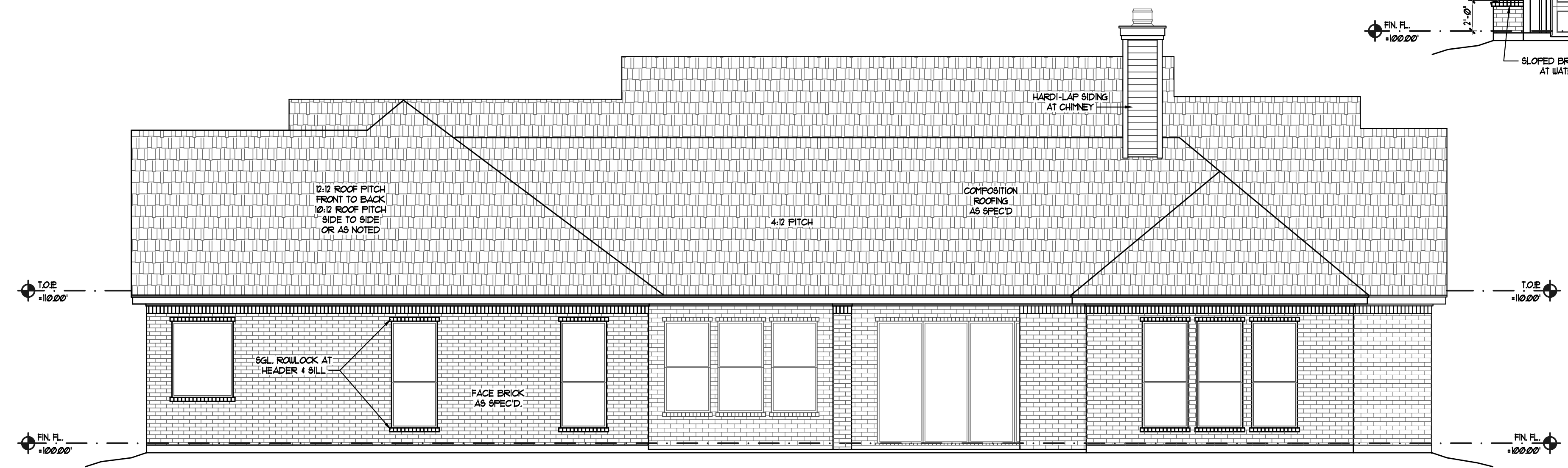
② REAR ELEVATION SCALE: 3/16" = 1'-0"