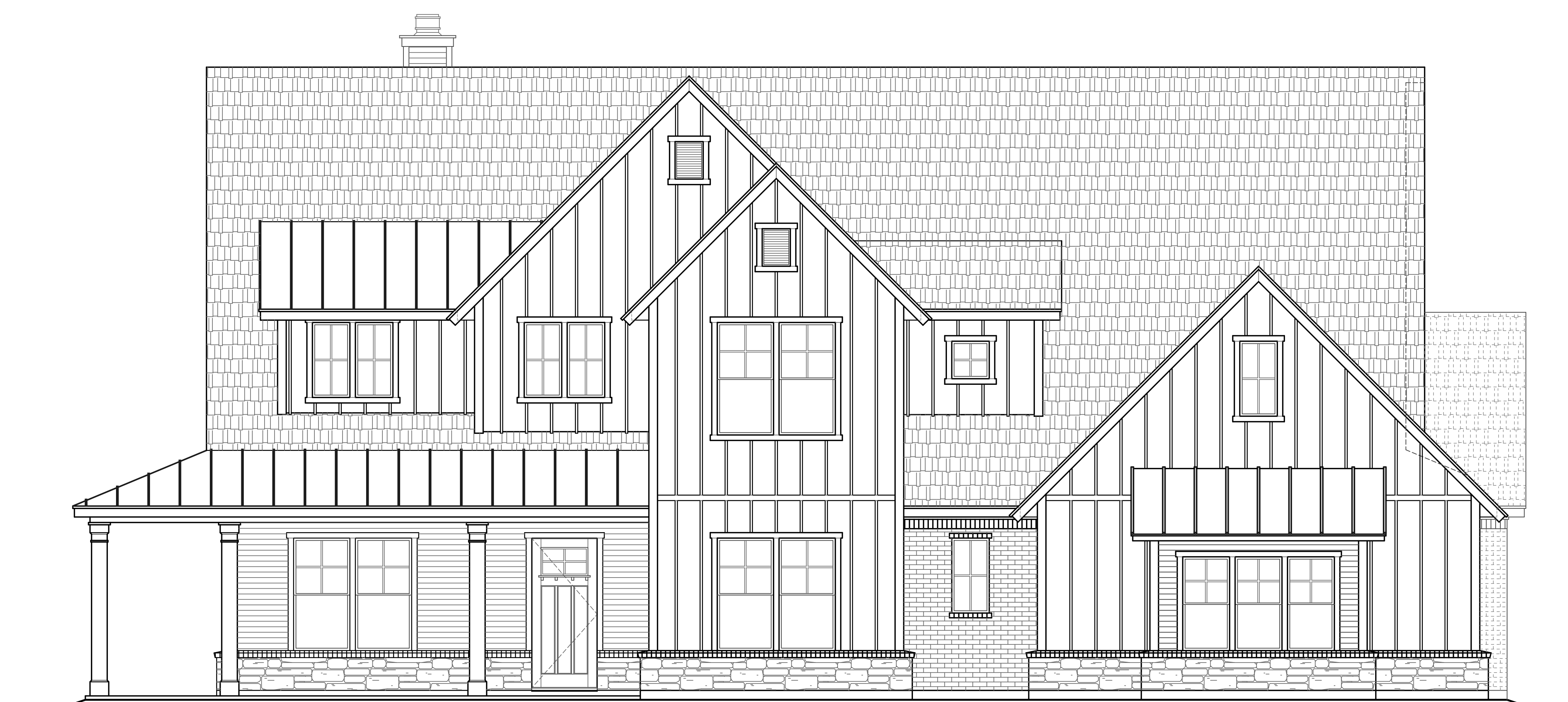
- PRELIMINARY FRONT ELEVATION (A) - THE STREET/RESIDENCE