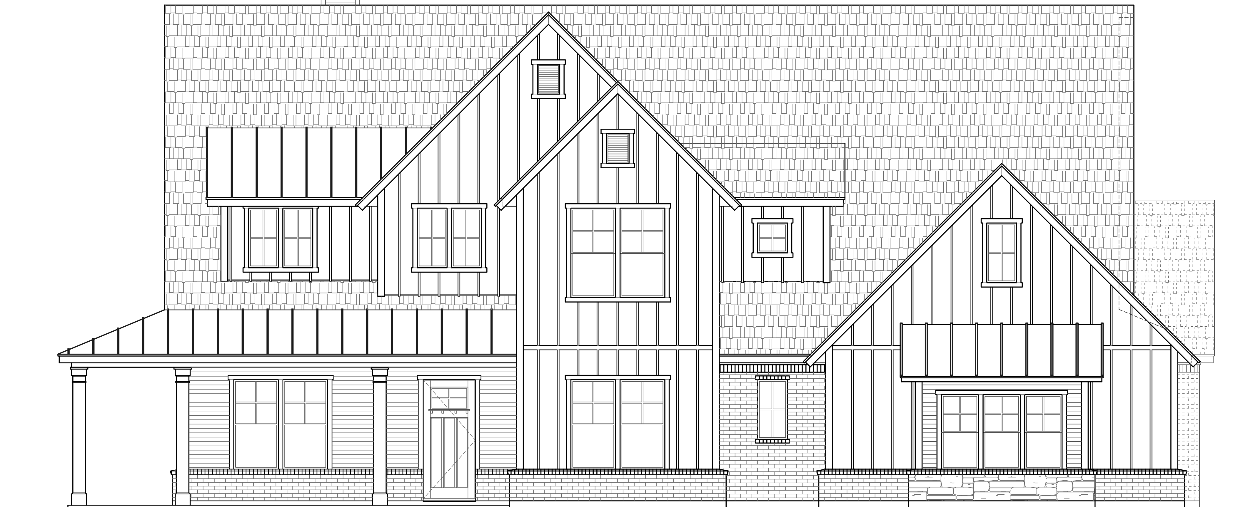
- PRELIMINARY FRONT ELEVATION (B) -

LOT: X, BLOCK: X - STAGECOACH RANCH ADDITION AN ADDITION TO PARKER COUNTY, TX. ROYAL CREST CUSTOM HOMES