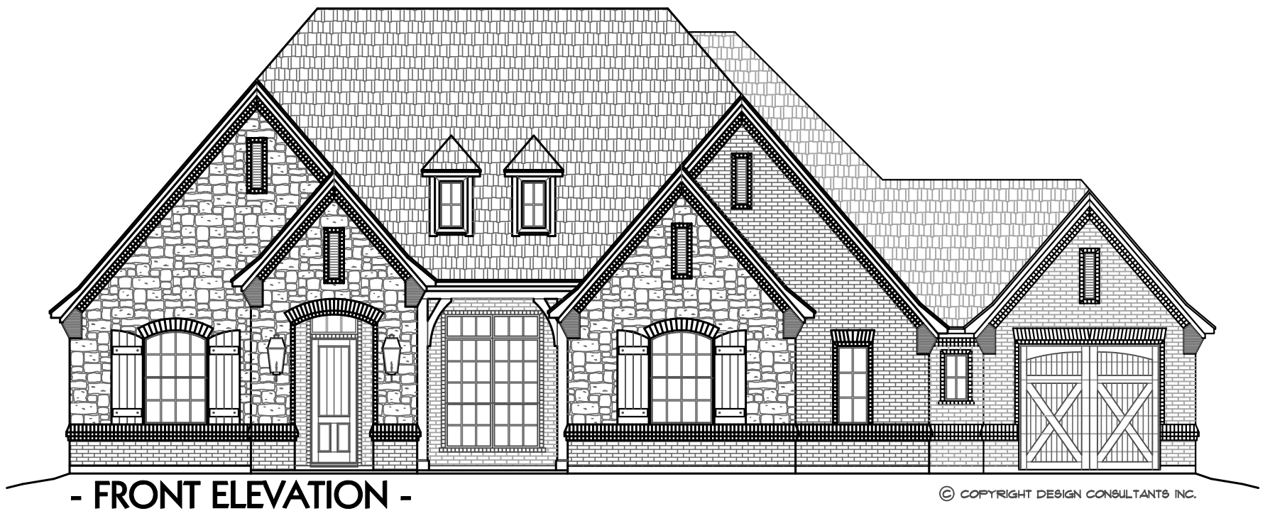
- FRONT ELEVATION -