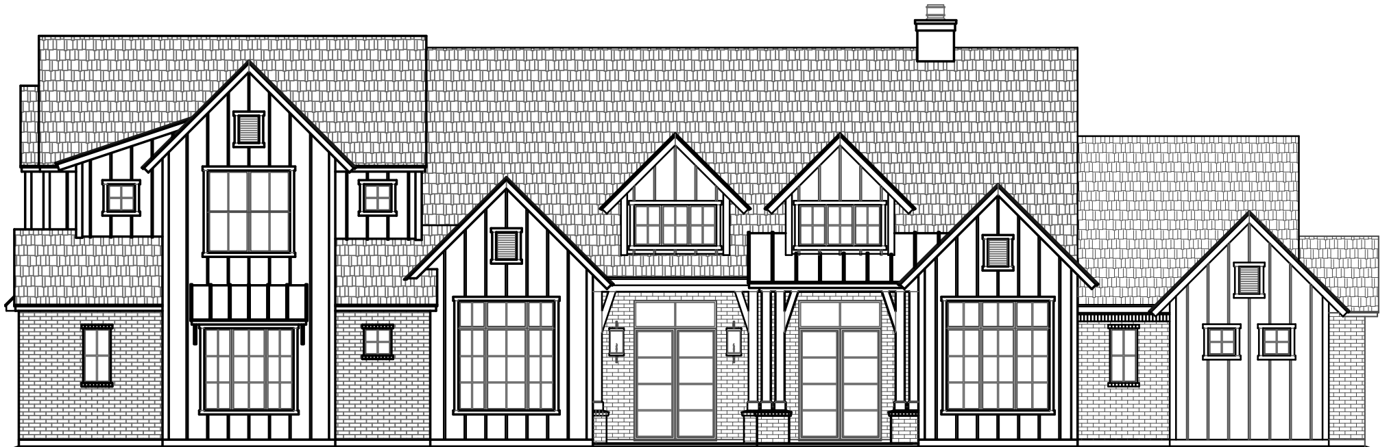
- FRONT ELEVATION -